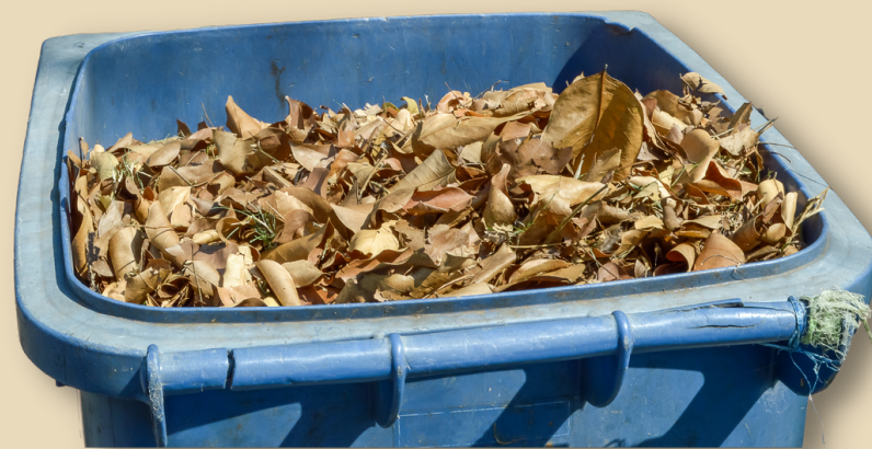
BROWNS Coco Peat/Dry Leaves/Saw dust/ Microbes or specific products for specific containers