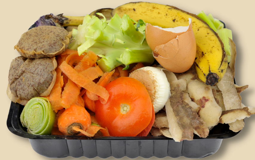
GREENS Kitchen waste