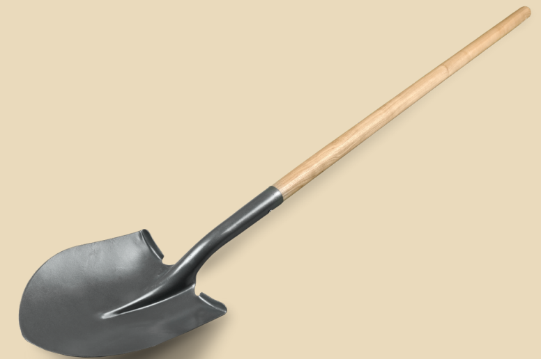
Shovel, Pitch fork